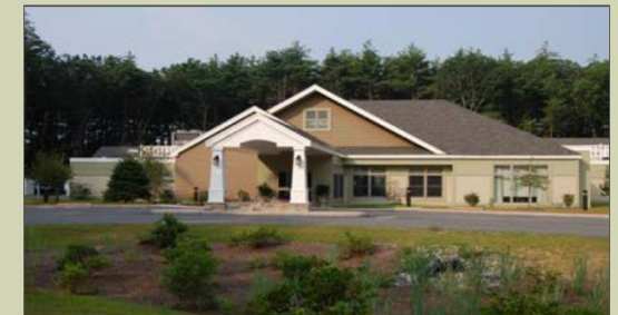
Merrimack Valley Hospice Testimonial:

A Better Chance of Andover Merrimack Valley Hospice Samaritans of Merrimack Valley Neighbors in Need, Lawrence Lazarus House Ministries, Lawrence Lawrence Community Works Acre Family Day Care, Lowell Greater Lawrence Head Start Habitat for Humanity, Merrimack Valley Andover High School, Substance Abuser Ironstone Farm, Andover Professional Center for Child Development, Andover Andover Community Trust YWCA of Greater Lawrence Samaritans of Merrimack Valley United Teen Equity Center (UTEK) (Lowell)